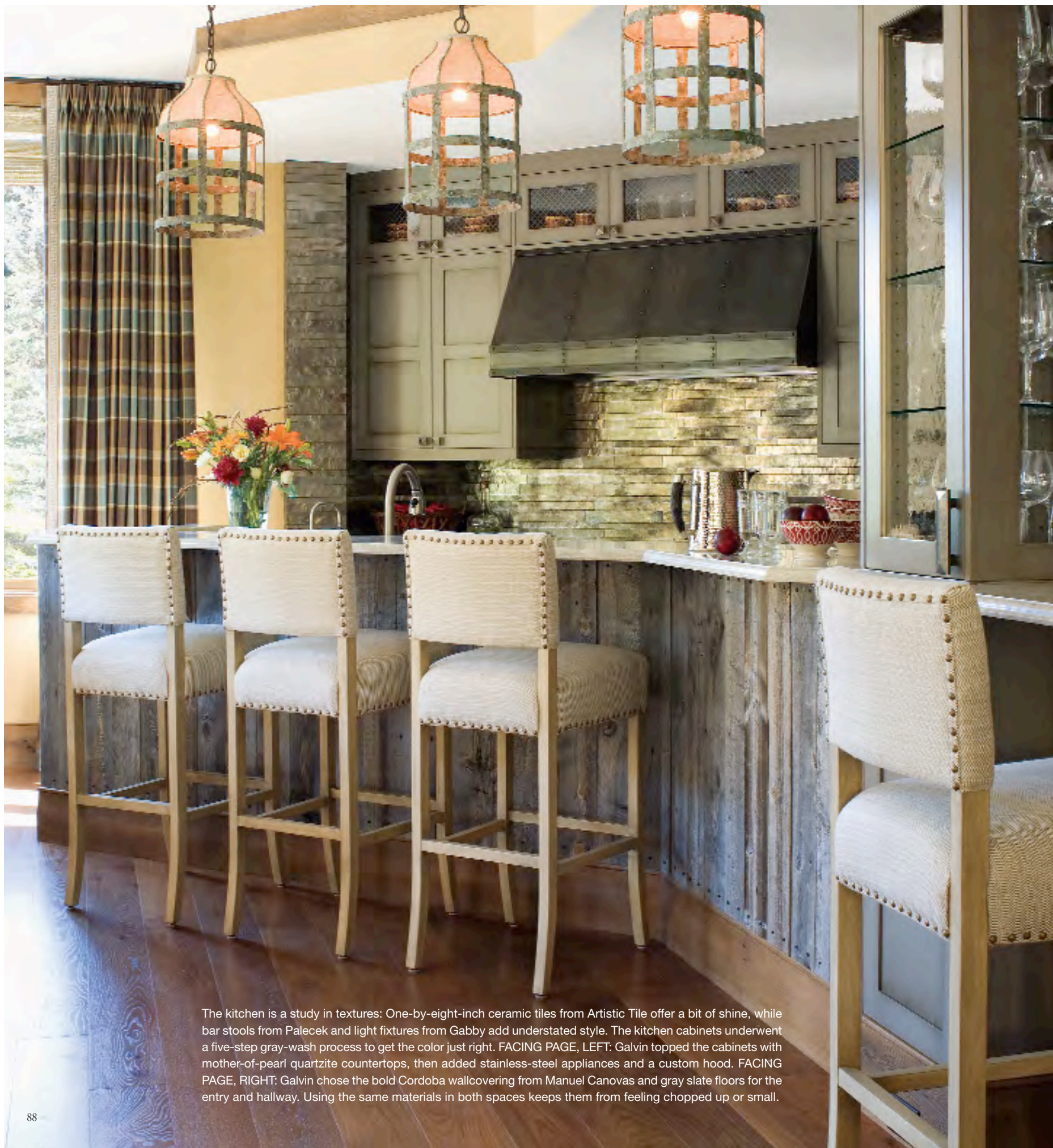
The kitchen is a study in textures: One-by-eight-inch ceramic tiles from Artistic Tile offer a bit of shine, while bar stools from Palecek and light fixtures from Gabby add understated style. The kitchen cabinets underwent a five-step gray-wash process to get the color just right. FACING PAGE, LEFT: Galvin topped the cabinets with mother-of-pearl quartzite countertops, then added stainless-steel appliances and a custom hood. FACING PAGE, RIGHT: Galvin chose the bold Cordoba wallcovering from Manuel Canovas and gray slate floors for the entry and hallway. Using the same materials in both spaces keeps them from feeling chopped up or small.

The design orders for this remodeled condo in Vail Village's Rams-Horn Lodge were straightforward: "Make the most of every square inch, just like in a ship," the client said.